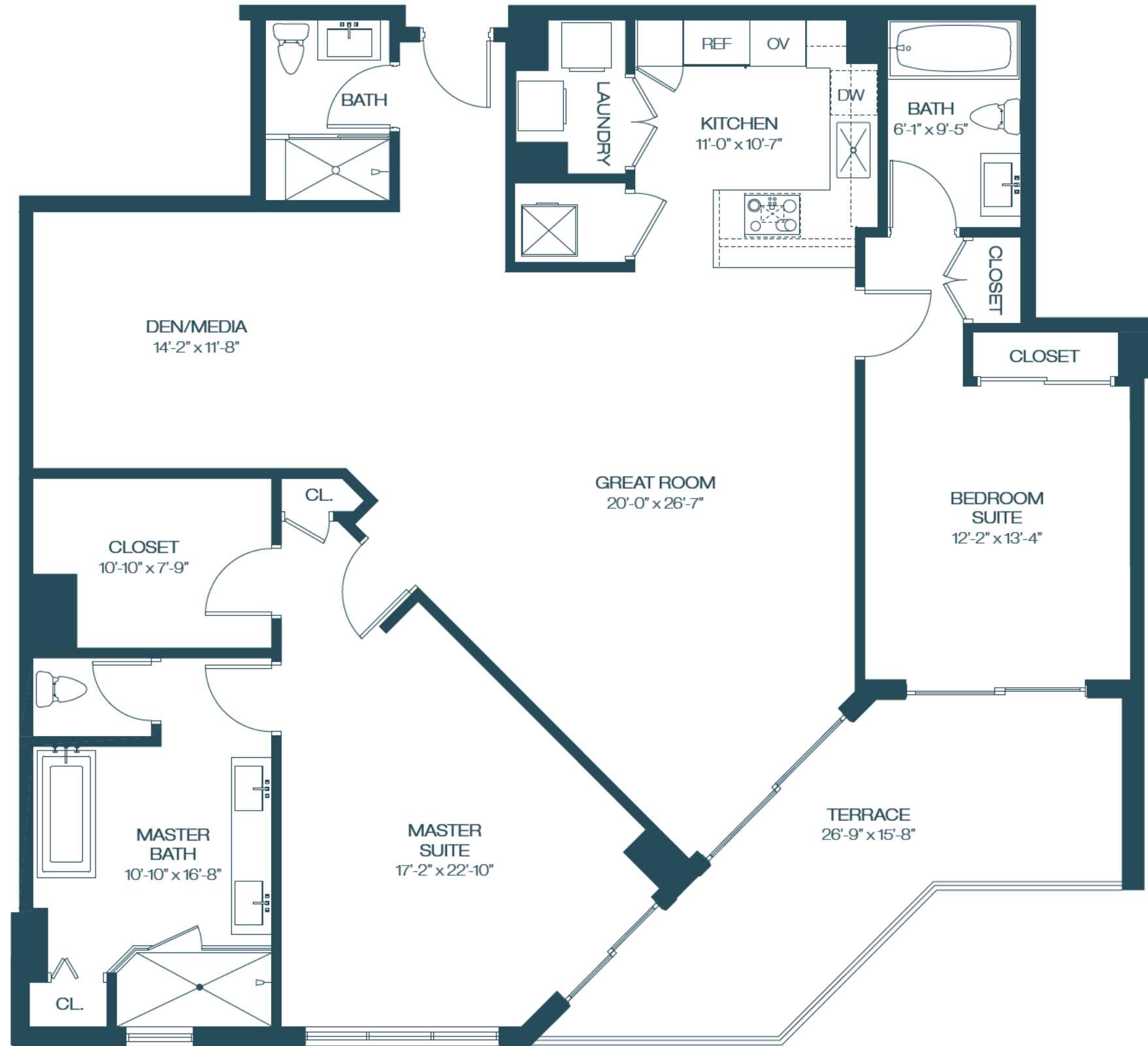
UNIT Ca - 08 Line