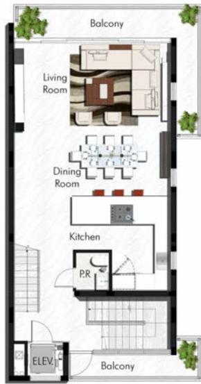
2nd Floor - Living 970 SF