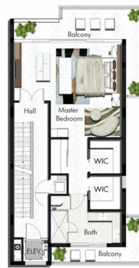
4th Floor - Master Suite 928 SF